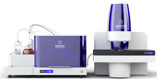
PhenoCycler®-Fusion System (formerly CODEX) Spatial Discoveries at Scale