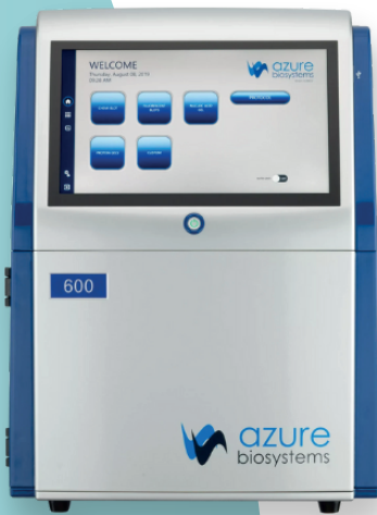
Azure Imaging Systems Workhorse systems for every lab