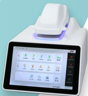
NanoReady Touch Micro volume (UV-Vis)