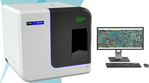
Phenolmager® (formerly Phenoptics) Spatial Discoveries at Scale