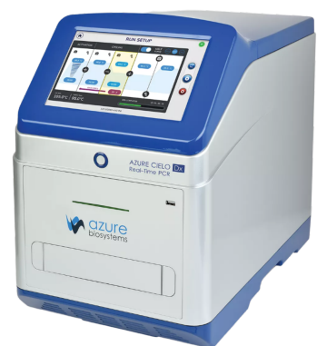
AzureCielo Real-Time PCR